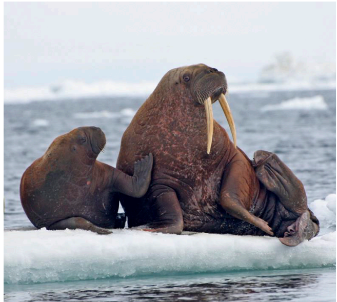
A walrus mother and her calf

Assessing cumulative effects (combined impacts from multiple sources) is essential to informed decision making about oil and gas activities in the Arctic. For example, there is considerable information about the impacts of noise on movements of bowhead whales, but very little is known about the cumulative